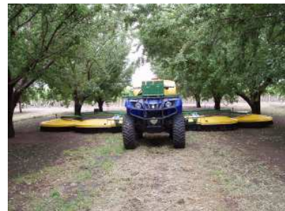
Adjust to correct width for spraying