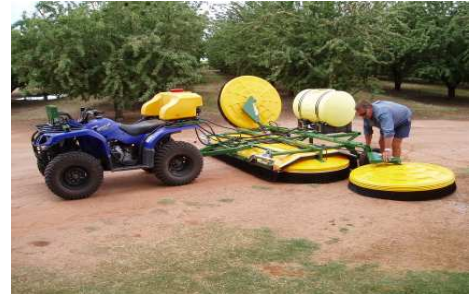
Adjust to minimum size for transport and storage